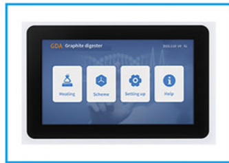
Touch screen operation

Graphite Digester adopts infrared radiation graphite conduction heating technology, accurate temperature control, uniform heating, fast heating speed.